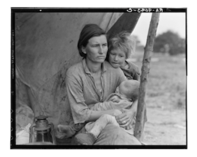
Figure 3a . One of several photos used by the composer to provide aesthetic inspiration for composing the sonfication scheme. Photo Credit: Dorothea Lange (1936), "Destitute pea pickers in California. Mother of seven children. Age thirty-two. Nipomo, California" [18].

During the first cycle, the pianist plays the notes in the score verbatim. The computer layers identical notes in a computer-enhanced timbre and diffuses them in a circular