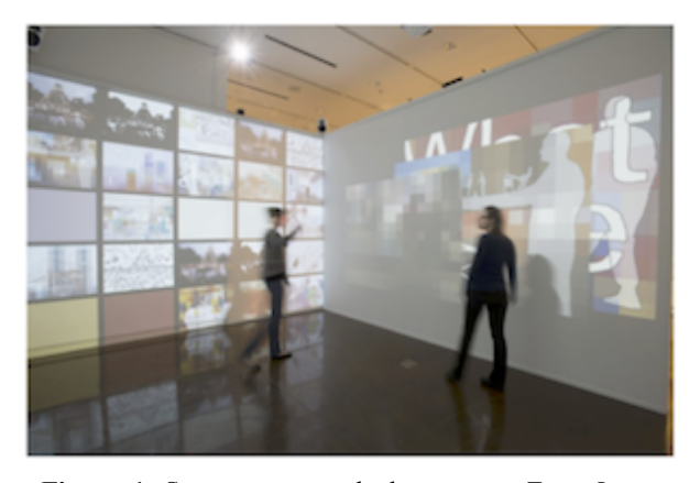
Figure 1 . Specter system deployment at Time Jitters exhibit. Photo shows two people moving through the installation. Two of the four speakers are visible (top-left and center). Also visible is one of the two Kinect sensors used in the installation (top right), and one of the four projectors (each projecting to one of the four walls enclosing the installation).

Computer Science Dept. College of Charleston, USA stoudenmiersh@g.cofc.edu