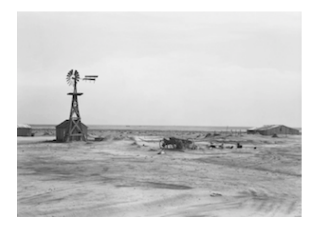
Figure 3b. Another of the photos used by the composer to provide aesthetic inspiration for composing the sonfication scheme. Photo Credit: Dorothea Lange (1938), "Abandoned farm with windmill and farm equipment. Dalhart, Texas. June 1938" [19].

pattern (or left-to-right pattern, for 2 speakers), thus generating a "flying-around" of notes.