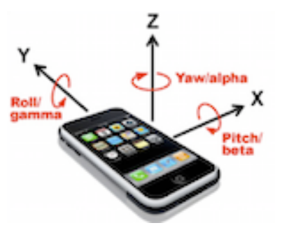
Figure 6. Smartphone Pitch, Roll, and Yaw directions.